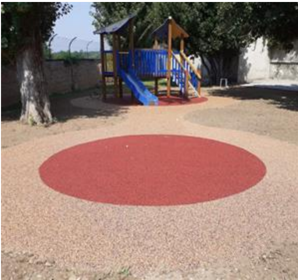
IMMAGINE NON DISPONIBILE