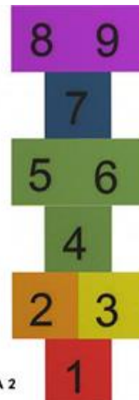
GIOCO CAMPANA 2