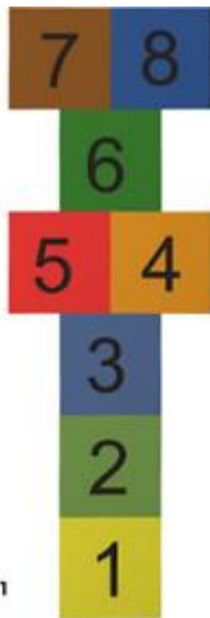
GIOCO CAMPANA 1