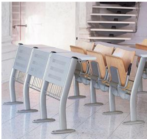
banco con piano ribaltabile